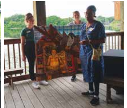
Eatonville Chamber of Commerce mixer at Audubon Center for Birds of Prey