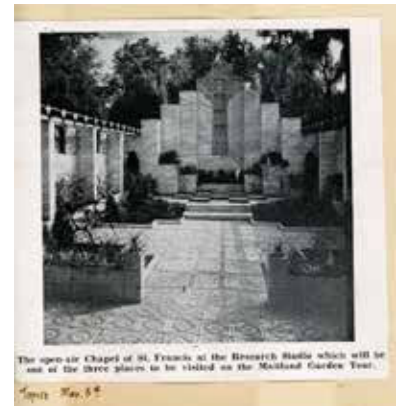
Figure 2 (March, 1948)

Among all the valuable pieces of history found in each Scrapbook, photographs are especially useful in uncovering what life at the Research Studio really looked like. The images in Figure 1, for instance, showcase the original vegetation and decoration of the campus, including orange trees still on campus from Maitland's citrus farming days. Captions for photographs also have proved to be valuable sources of information, as is evident in the 1947-48 scrapbook. Featuring a photograph of the Garden Chapel (figure 2), the caption describes the scene as a "Chapel of St. Francis", a dedication which was unbeknownst by A&H staff until researching images for this article.