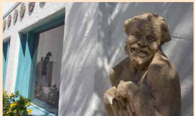
Pan's temporary home outside Studio 2