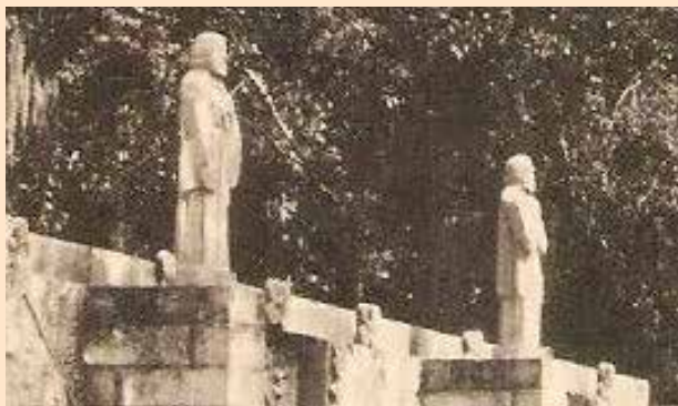
Apostles in the Chapel