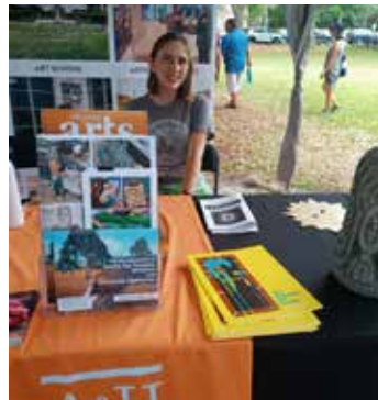
At Central Florida Earth Day festival in downtown Orlando