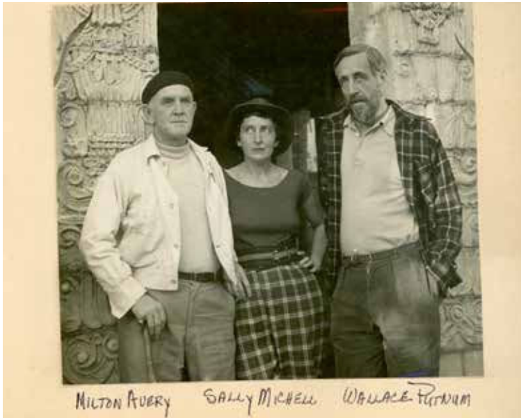
Figure 4 (ca. 1950)