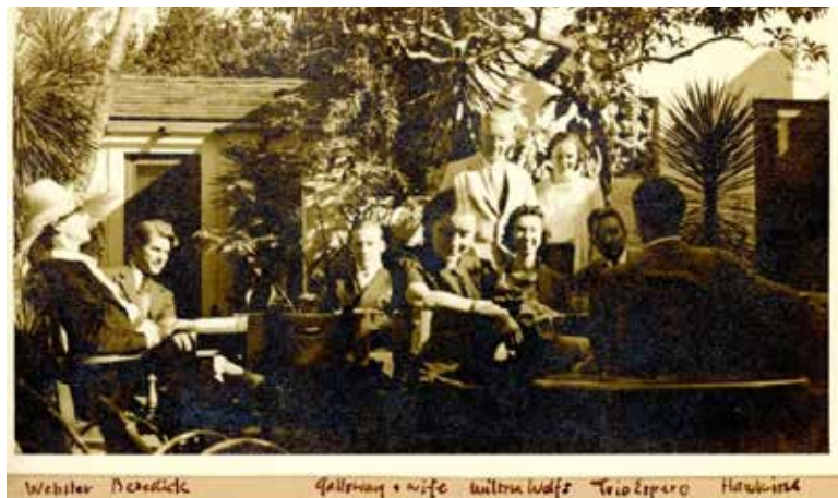
Figure 3 (ca. 1940)

Photographs of the resident artists also frequented the pages of Smith's scrapbooks. Figures 3 and 4 show the camaraderie of the small artist community, and some big names of the art world that visited the campus. All these images, along with the newspaper articles and exhibition catalogues, paint a vivid picture of what the Research Studio was like. But the true essence of the Research Studio is perhaps best captured in the personal touches that Smith made on each page. The small sketches, poems, cartoons, and even a reminder of mealtime (figure 5) truly encapsulate the true spirit of The Research Studio as it represents one man's vision to push boundaries and to open new doors.