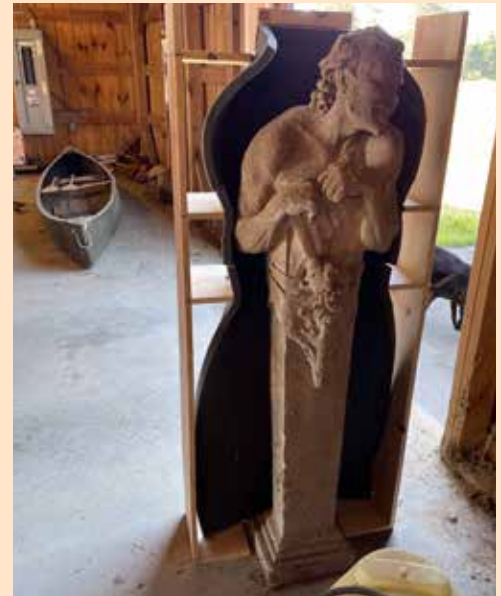
Preparing for transport from South Carolina