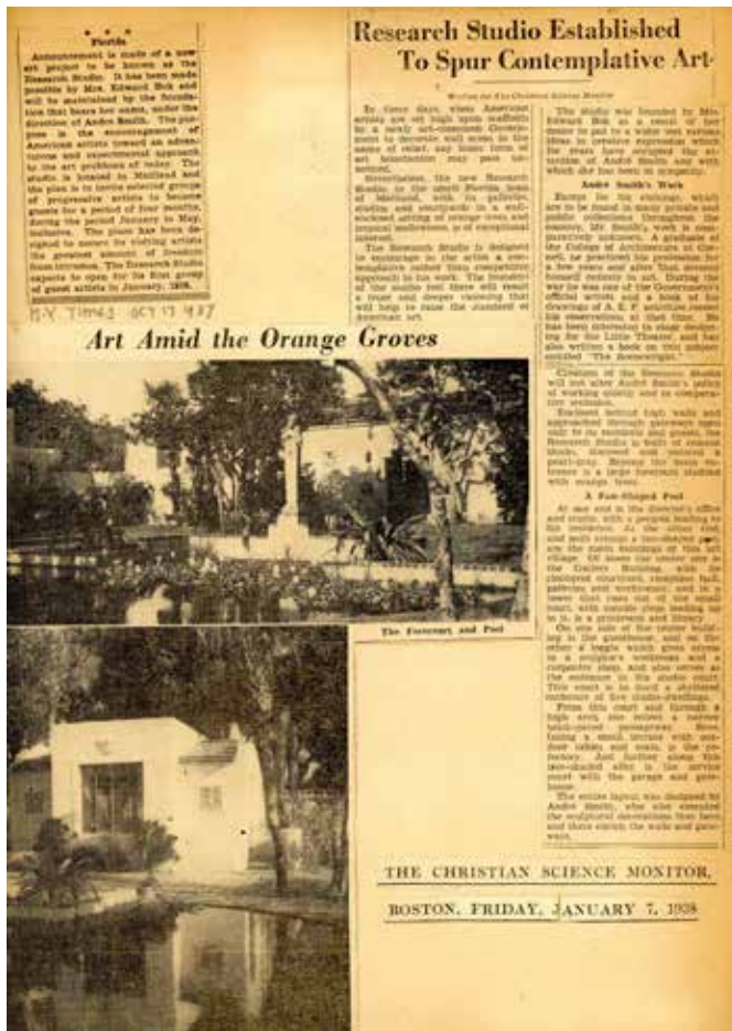
Figure 1 (1938)

Throughout the 21-year run of the Research Studio, Smith collected memorabilia detailing all the happenings of the artist's retreat. Artifacts like exhibition announcements and reviews, newspaper clippings, and photographs fill each book's pages. Indeed, Smith's scrapbooks have proved to be so full of information that even staff members whose jobs are to be particularly familiar with such artifacts, like myself, find something new with every look through.