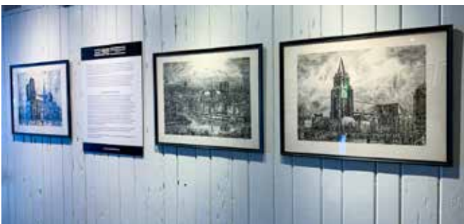
Partnership with Maitland Civic Center showcasing curated selections from A&H's art collection