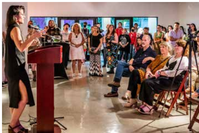
Artist talk at exhibition opening