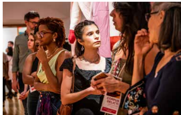
Gallery during exhibition opening